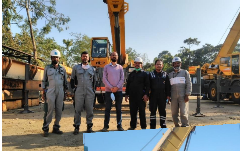
TRAINING IN PROGRESS ONSITE & OFFSITE