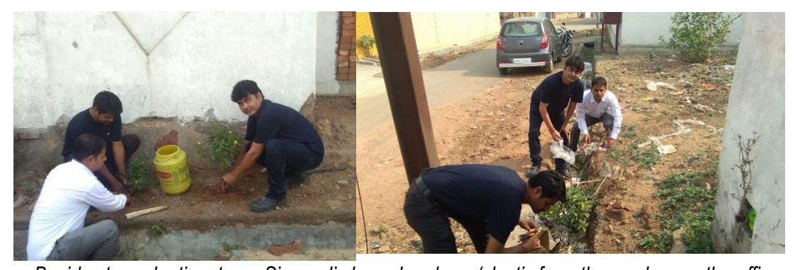
Besides tree planting, team Singrauli cleared garbage/plastic from the roads near the office.